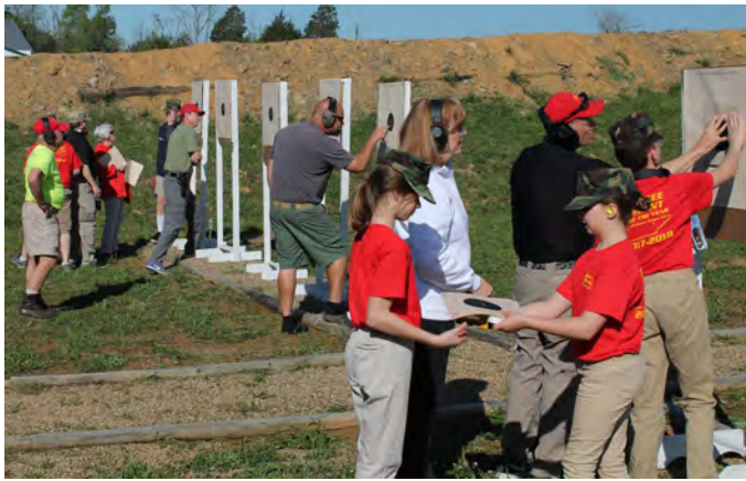
Young Marines and Adult Volunteers score and service targets at the pistol match on 28 April.

Pensacola here we come! We leave on June 2nd for a week of fun and learning. We have barracks on the Naval Air Station and have arranged some great activities for the entire week including seeing the Blue Angels, the NAS Museum, the USS Alabama, Fort Barrancas and whatever else we can fit into the schedule. We will also be having a beach night with the Pensacola Young Marines. Wish us a safe journey.