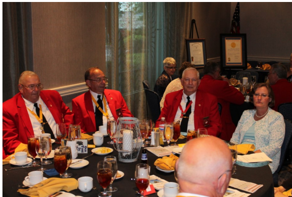
DEPARTMENT CONVENTION BANQUET