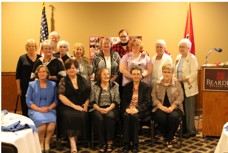
LADIES OF THE AUXILIARY UNIT CELEBRATE 20 YEARS OF SERVICE