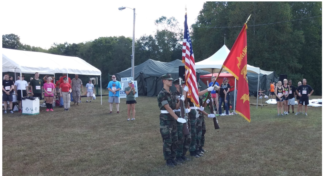
YOUNG MARINES PRESENT THE COLORS AT THE MUD RUN