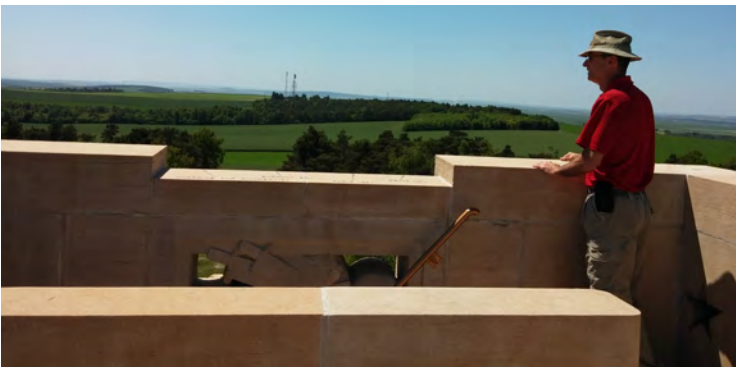
The view of Blanc Mont Ridge as seen today from the memorial tower. Most of the area has been reclaimed for agriculture although some areas, including the main German bunker complex, are off-limits to visitors (I tried!). -your editor