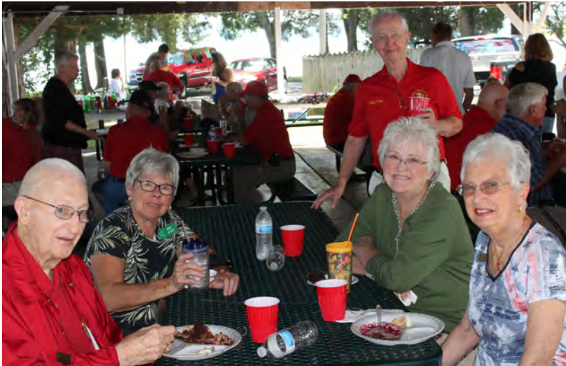
League members, family and friends enjoying the annual picnic at Lenoir City Park

It's Wreaths Across America time! Be sure to bring your donation to the League meeting!