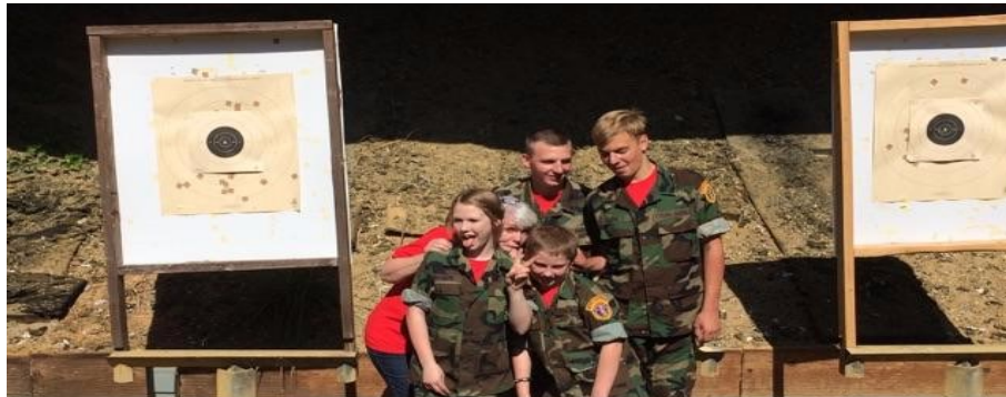
PISTOL RANGE CREW HAVING FUN