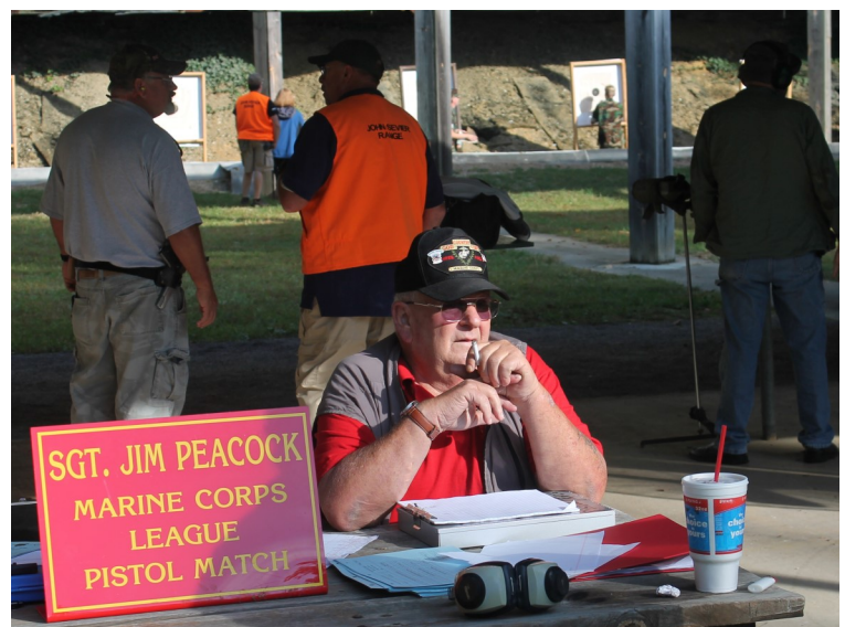
PISTOL MATCH SIGN UP