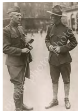
Marine MP in Paris having a discussion with an Army Officer