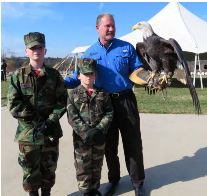
Bald Eagle named "Mr Lincoln"

Our new Recruit Class will start on February 3, 2018. Our parent orientation will be on January 20th at 0900 at Eagleton Elementary School. If you know a youngster who would like to join our program, please have them email youngmarinesbonnyman@gmail.com , and we will get back to them.