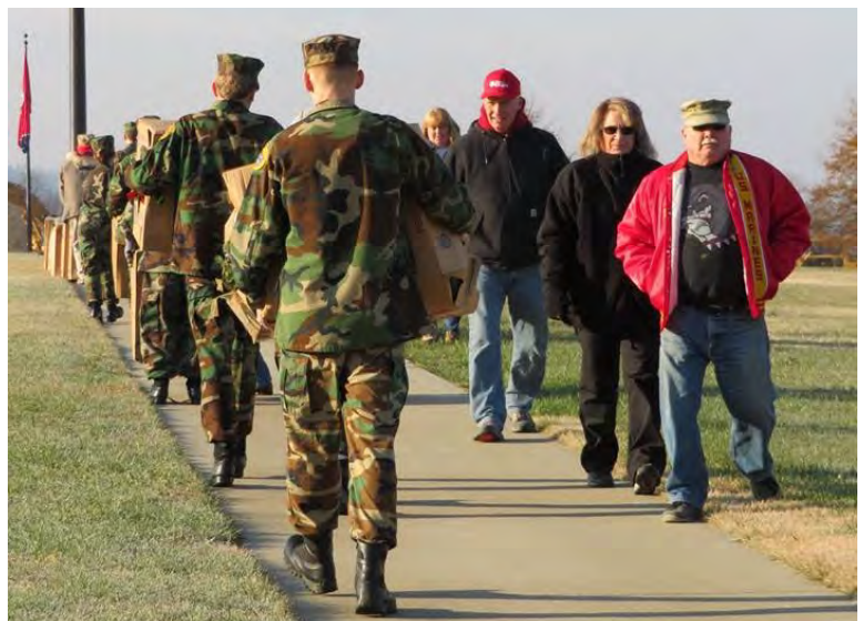
Young Marines and volunteers help place "Wreaths Across America".