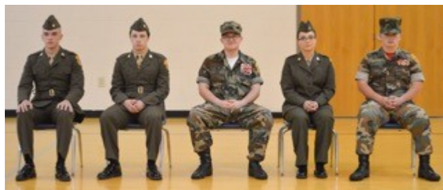
2017 YOUNG MARINE RETIREES